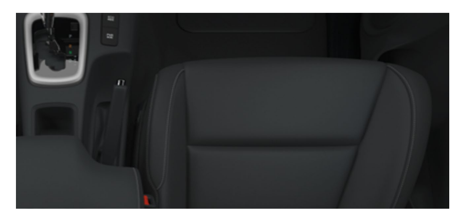
Black leather (LA20) * Only available on SR5 MHEV