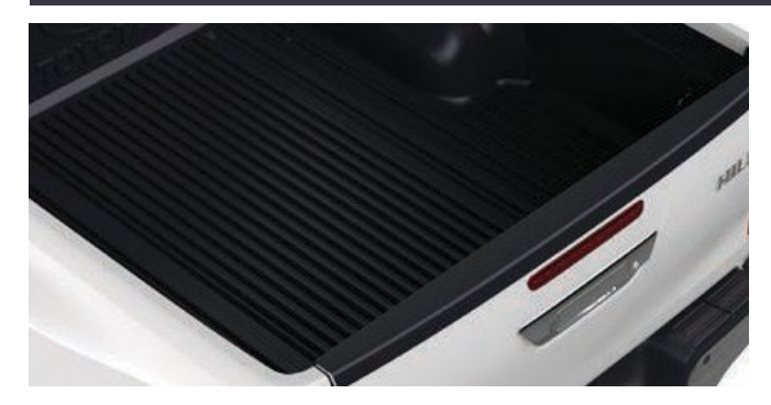
UNDER RAIL BED LINER

Precision moulding for maximum load space, this polyethylene liner covers both the deck bed and side panels.