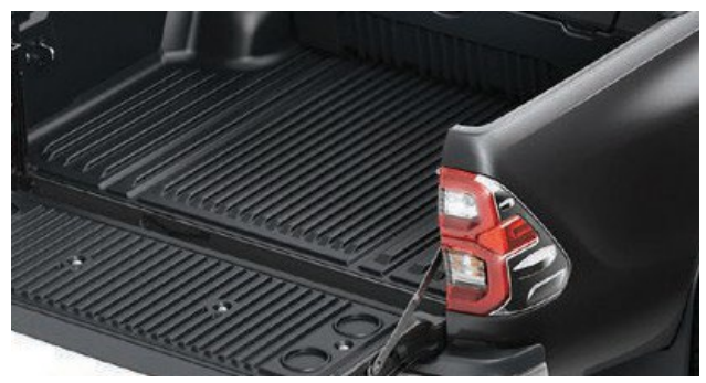
UNDER RAIL TAILGATE LINER

Precision moulding for maximum load space, this polyethylene liner covers both the deck bed and side panels.