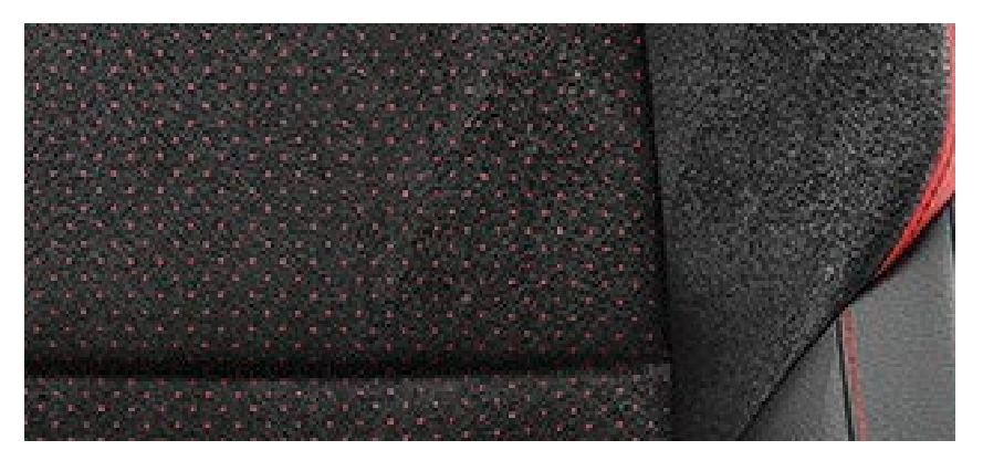
Black leather and synthetic suede (LG25) GR SPORT II