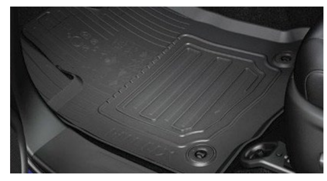
RUBBER FLOOR MATS

Protect the tailgate inner surface from loading damage and general wear and tear with this tough liner.