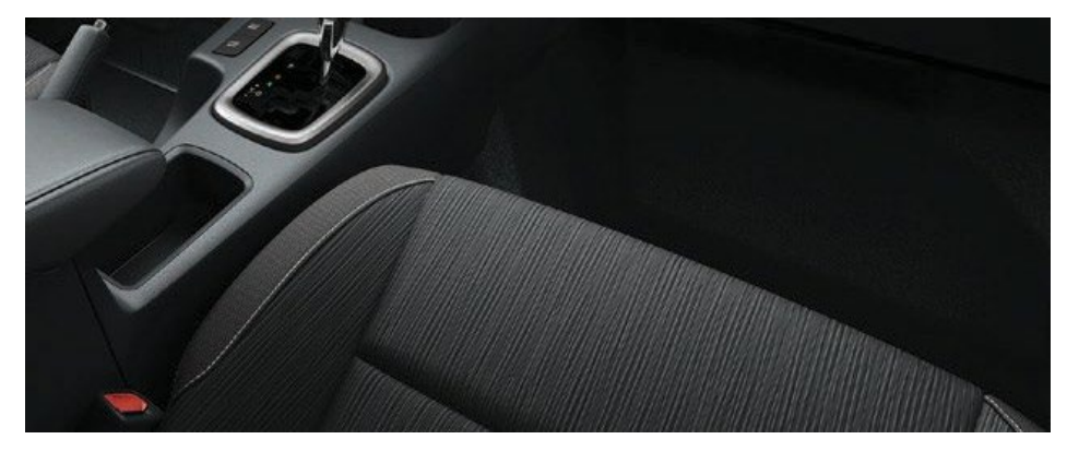
Black fabric with vertical pattern (FE20) SR5

A choice of two fabric and leather finishes are now available with a unified black instrument panel that delivers a fresh image.