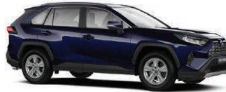
Midnight Blue (8X8)