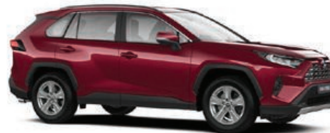
Tokyo Red (3T3) Pearlescent