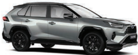
Silver Metallic Bi-tone (2QY)