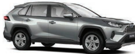
Silver Metallic (1D6)