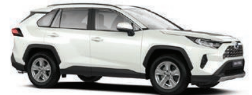
Pearl Ice White (089) (Pearlescent)