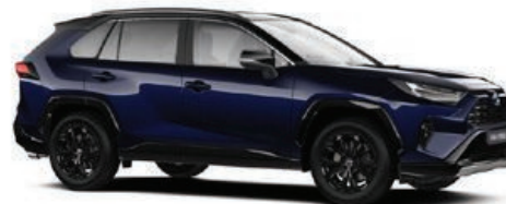
Midnight Blue Bi-tone (2RA)