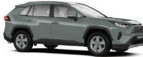
Urban Khaki (6X3)