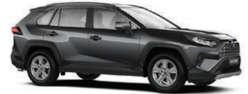
Ash Grey (1G3)