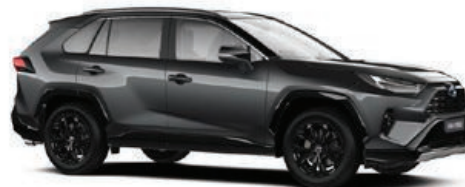
Ash Grey Bi-tone (2QZ)