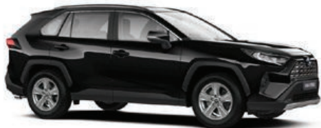
Attitude Black (218)