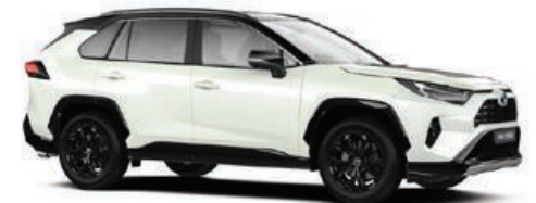
Pearl Ice White Bi-tone (2PS) (Pearlescent)